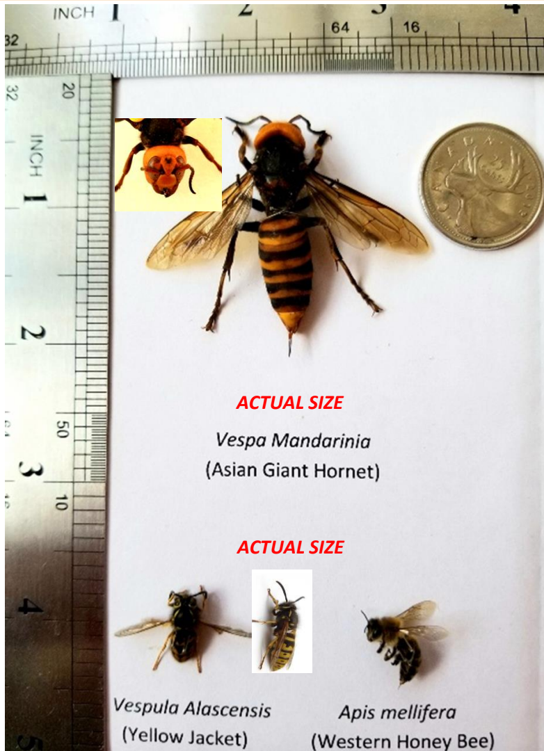
ACTUAL SIZE Vespa Mandarinina (Asian Giant Hornet)